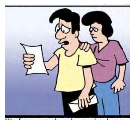
"Its from our church... we've been called up for active duty."